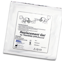
Replacement Adhesive Gels for CPR-D-padz Training Electrode Part #8900-0803-01