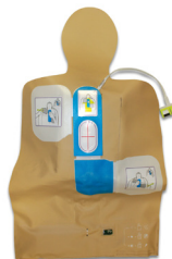
Travel Trainer One-piece demonstration tool for clinical AED Plus. Part #8008-0006-01