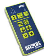
AED Plus Trainer2 Replacement Wireless Remote Part #8008-0007