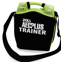
AED Plus Trainer Carry Case Includes pocket for storing extra set of training electrodes. Part #8000-0375-01