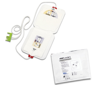
Stat-padz® II Training Electrodes (Case of 6) For use with AED Plus Trainer2. Part #8900-0805-01