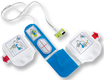
CPR-D-padz Training Electrode Part #8900-0804-01

Everything you need to simulate a rescue with the AED Plus.