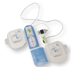
CPR-D Demo padz Demonstration electrode for use with the clinical AED Plus. Part #8900-5007