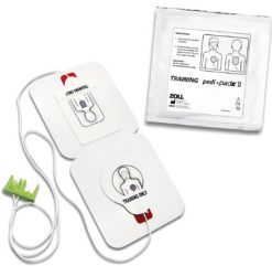
Pedi-padz II Training Electrodes (Case of 6) For use with AED Plus Trainer2. Part #8900-000861-01