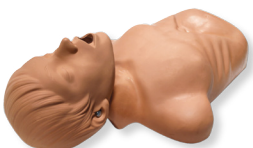
Demo Manikin Part #8000-0835-01